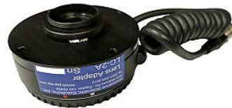
LC-2A-C (C-Mount Lens Adapter)