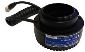
LC-2A-M42 (M42-Mount Lens Adapter)