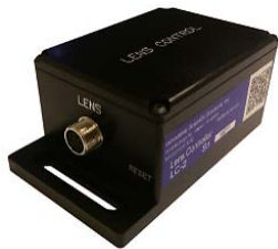
LC-2 (Control Box)